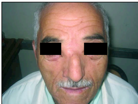
Figure 1: Swelling of the base of the nose with telecanthus

Nasal endoscopy confirmed these data and permitted several biopsies to be taken for histological analysis. The histology confirmed the diagnosis of a pleomorphic adenoma.