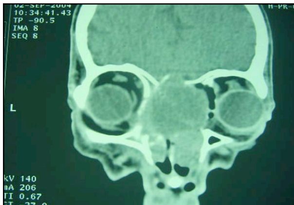
Figure 4: Axial naso-sinus CT scan that shows lysis of posterior wall of frontal sinus with endocranial extension